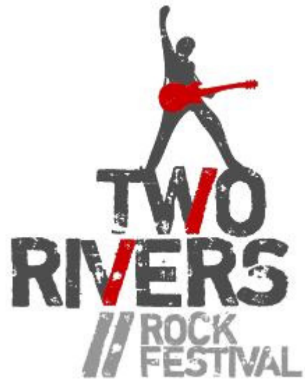
Two Rivers Rock Festival

"If you want to fly through your school exams with our help get in touch with us... From beginner to top performer we can get you there."